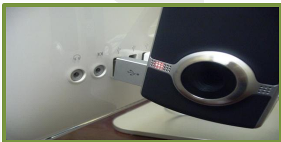
4. Gently insert the FlipVideo into your USB port. If available use a USB extension cable.